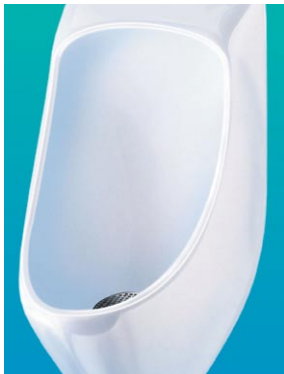
Urimat Waterless Urinal